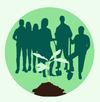
2,839 community groups engaged