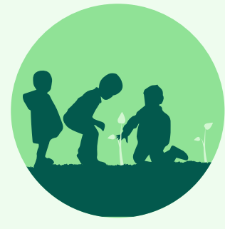
2,854 schools engaged