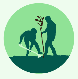
240,680 people planting trees