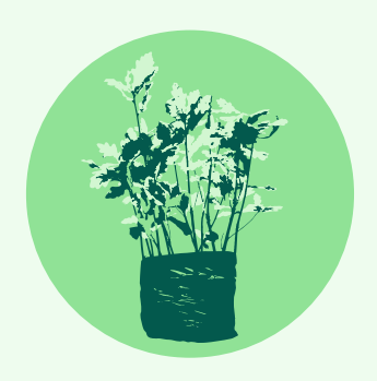
1,093,050 native trees applied for in Autumn 2020 and Spring 2021.