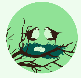
683 hectares of woodland could support 1,242 pairs of breeding robins.